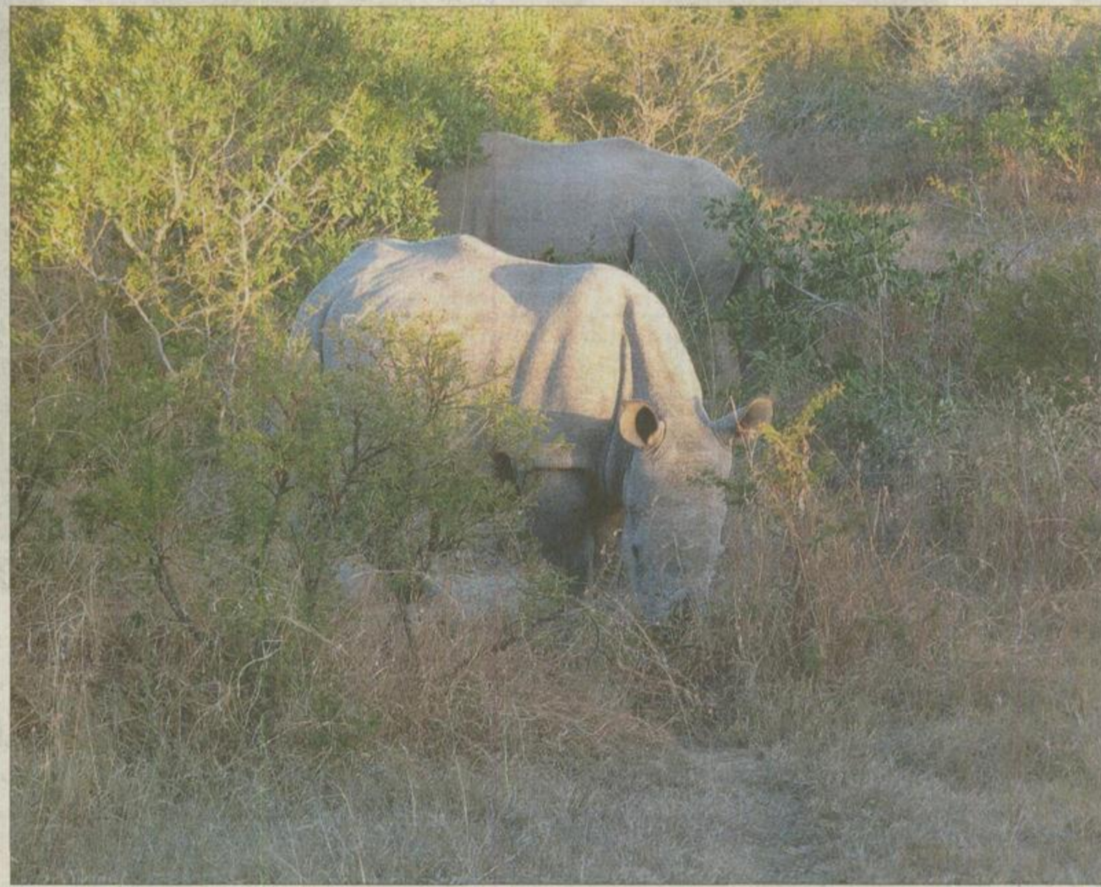
BIG BABIES: Juvenile rhinos Nthombi and Thabo roam (fairly) free at Thula Thula, a private game reserve near Empangeni in KwaZulu-Natal.