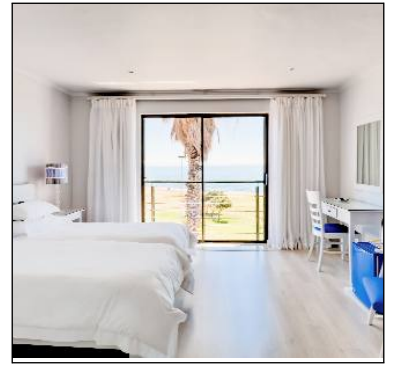
REVAMPED: Expect gorgeous views from La Splendida Hotel