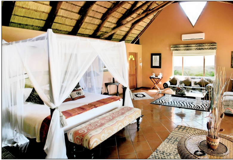
LAP OF LUXURY: You'll be spoilt rotten in the open-plan thatched Suite Royale at Thula Thula.