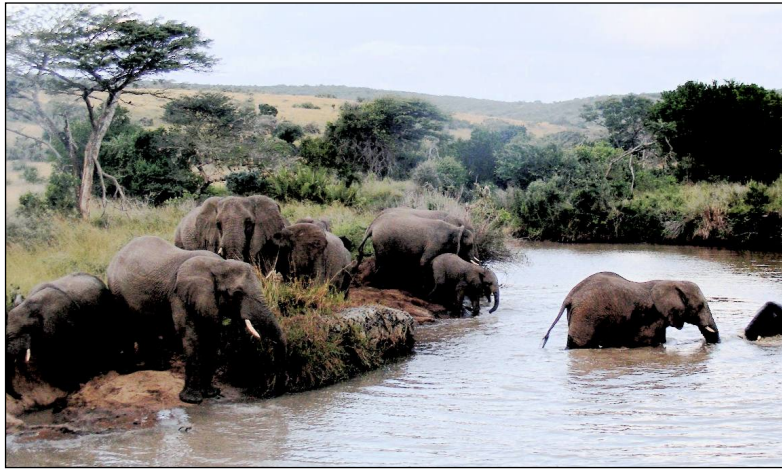
TAKING A DIP: Elephants bathe in the river at Thula Thula, one of the oldest reserves in KwaZulu-Natal.